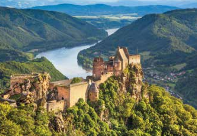
Cruise along the Danube River through the stunning natural beauty of the Wachau Valley landscape, a UNESCO World Heritage site.