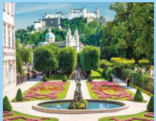
Stroll through the Baroque pleasure gardens of Mirabell Palace in the heart of Salzburg.

showcasing the impressive Vienna State Opera House and Hofburg Palace. Visit the iconic, Gothic-style Stephansdom (St. Stephen's Cathedral). After lunch on board the ship, visit the UNESCO World Heritage-designated